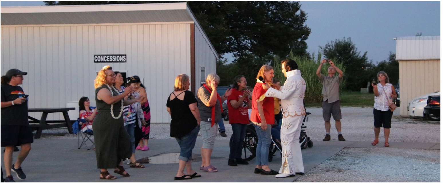
Elvis Tribute (August 17th)—Handing out scarf to the woman.